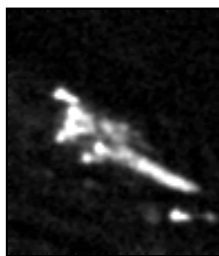
Movie 1. cilia of C. elegans as seen by time-lapse microscopy of GFP-labelled OSM-1.

The two sequential anterograde IFT-pathways are coordinated by at least two types of regulator proteins. Two C. elegans homologs of human Bardet-Biedl Syndrome (BBS) proteins (BBS-7 and BBS-8) have been shown to stabilize the IFT-particle subcomplexes A and B which are bound to the Kinesin-II and OSM-3 IFT-motors, respectively (Blacque et al., 2004; Ou et al., 2005a; Snow et al., 2004). Abrogation of BBS protein function results in slightly truncated cilia and chemosensory or lipid accumulation defects (Blacque et al., 2004; Mak et al., 2006). The implications for this observation are of interest given that BBS, which is characterized by a diverse array of ailments, including obesity, cystic kidneys, and retinal degeneration, is one of a growing number of known ciliopathies (Beales, 2005; Blacque and Leroux, 2006). At least eight genes encoding BBS proteins are present in C. elegans (Table 2). The second modulator of the sequential IFT pathway, a conserved ciliary protein also first characterized in C. elegans , DYF-1, specifically docks the OSM-3 kinesin onto IFT-particles and simultaneously activates its motor activity; a dyf-1 mutant therefore specifically lacks the distal segment singlet microtubules (Ou et al., 2005a).